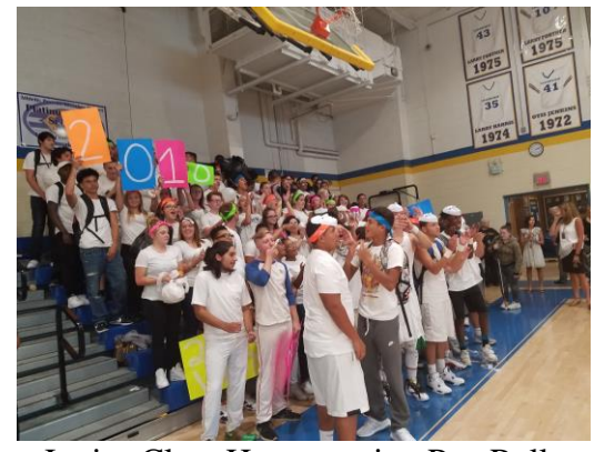
Junior Class Homecoming Pep Rally

You can view pictures from CHS, Homecoming, and Spanish Club using the link below: https://drive.google.com/drive/folders/0B-ejg1LhkVgeNlpBY0N3TlVMM0U?usp=sharing