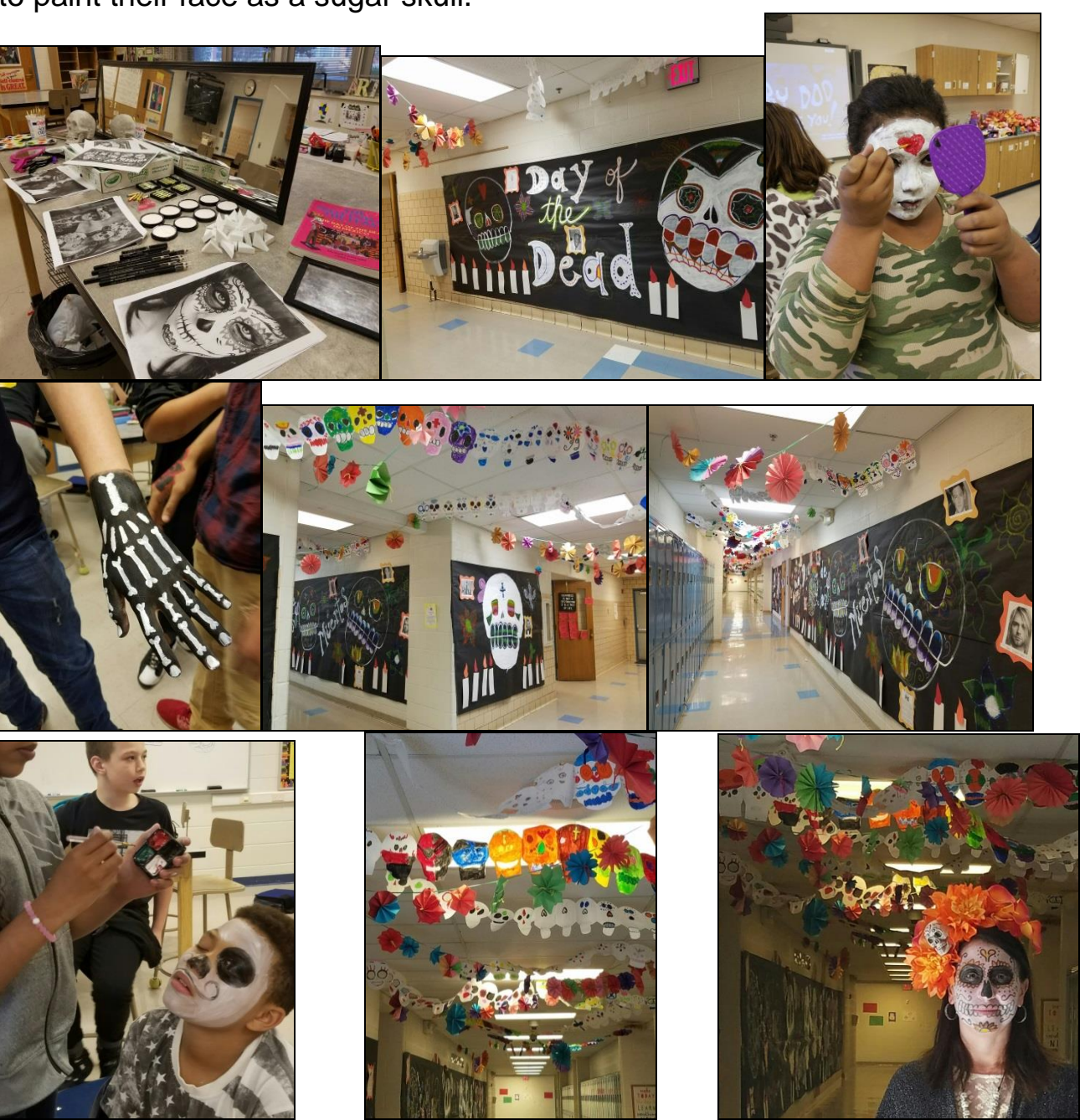
The Day of the Dead is a time of celebration and remembrance of loved ones who have passed away, much like Memorial Day in the United States. Celebrating the day of the dead is a true celebration of life.

"Days of the Dead"...In October, DMS art students learned about the Mexican holiday, los Dias de los Muertos. They created large scale artwork based on the tradition and displayed it throughout the hallways. They also had an opportunity to paint their face as a sugar skull.